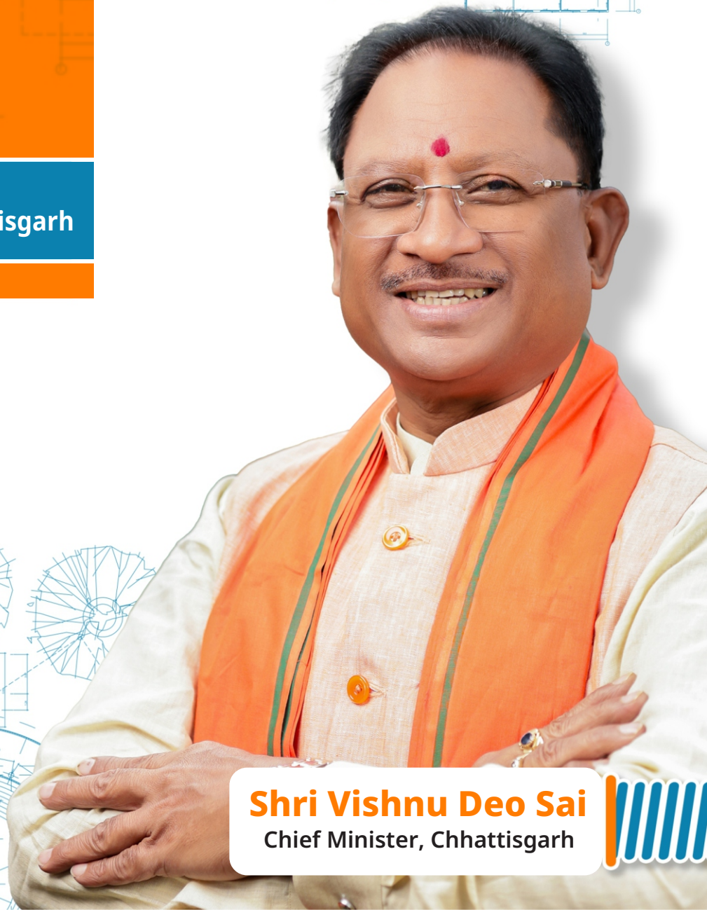
Shri Vishnu Deo Sai Chief Minister, Chhattisgarh